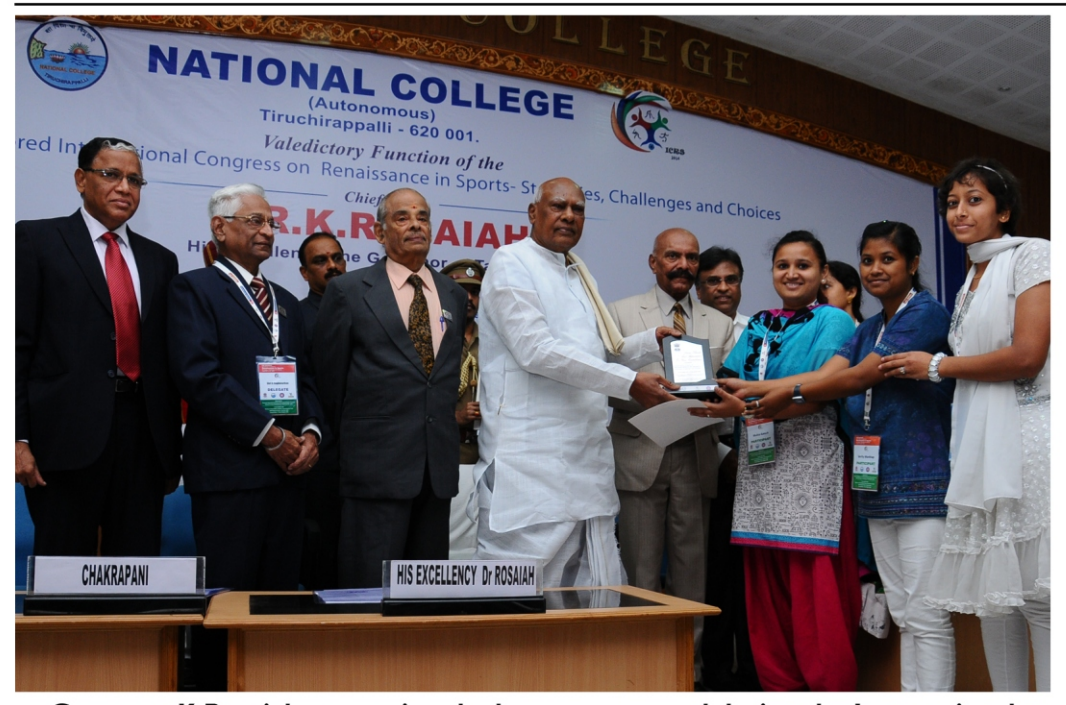
Governor K.Rosaiah presenting the best paper award during the International Congress on Renaissance in Sports -ICRS 2014

"That alone is knowledge which liberates"